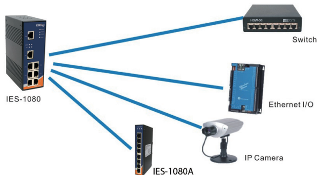
Connections of Ethernet devices

IES-1080/1062 series can be used in connecting several Ethernet devices like Ethernet I/O, IP-Camera or other Ethernet switches. In addition, there are three different power inputs to enhance its reliability, two supplied by terminal block, and one by power jack to avoid interruption caused by power down. When the primary DC power input fails, the backup power input will take over immediately to guarantee a non-stop operation.